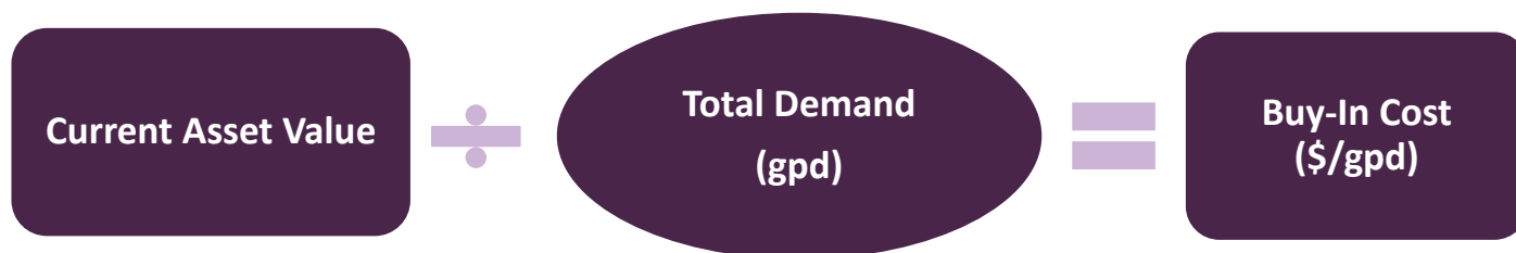
Figure 2 – Buy-In Method