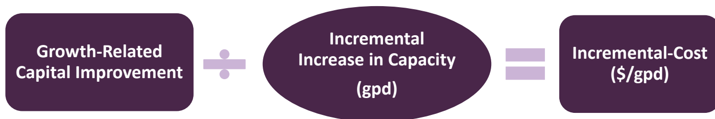
Figure 3 – Incremental-Cost Method

The Incremental-Cost Method is based on the principle that new development should pay for improvements required to connect them to the system, including the need for any additional capacity and/or expansions. This approach is typically used when specific capital improvements are identified within planning documents and required for growth. Projects associated with routine repair & replacement and Master Plan improvements required to address existing deficiencies are excluded. Specific projects within the Master Plan may benefit existing and new development. In these instances, new development only pays its proportionate share based on the demand or capacity taken from these projects. Under the Incremental-Cost Method, growth-related capital improvements are allocated to new development based on their capacity requirements. Figure 3 shows the framework for calculating capacity fees using the incremental cost method.